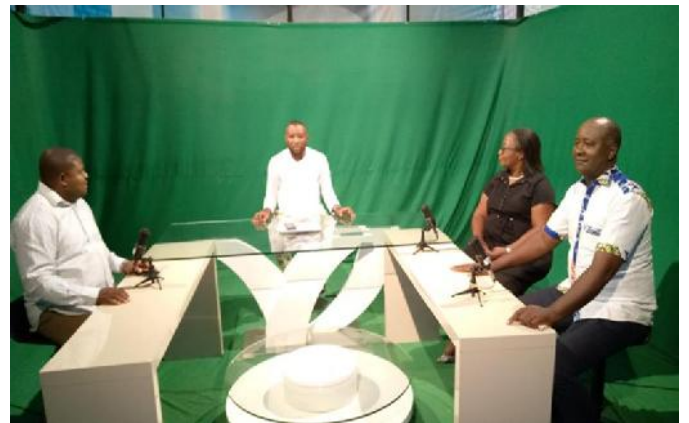
g- Débat télévisé à la CRTV sur les défis liés à l'implication de l'IFFB dans APV