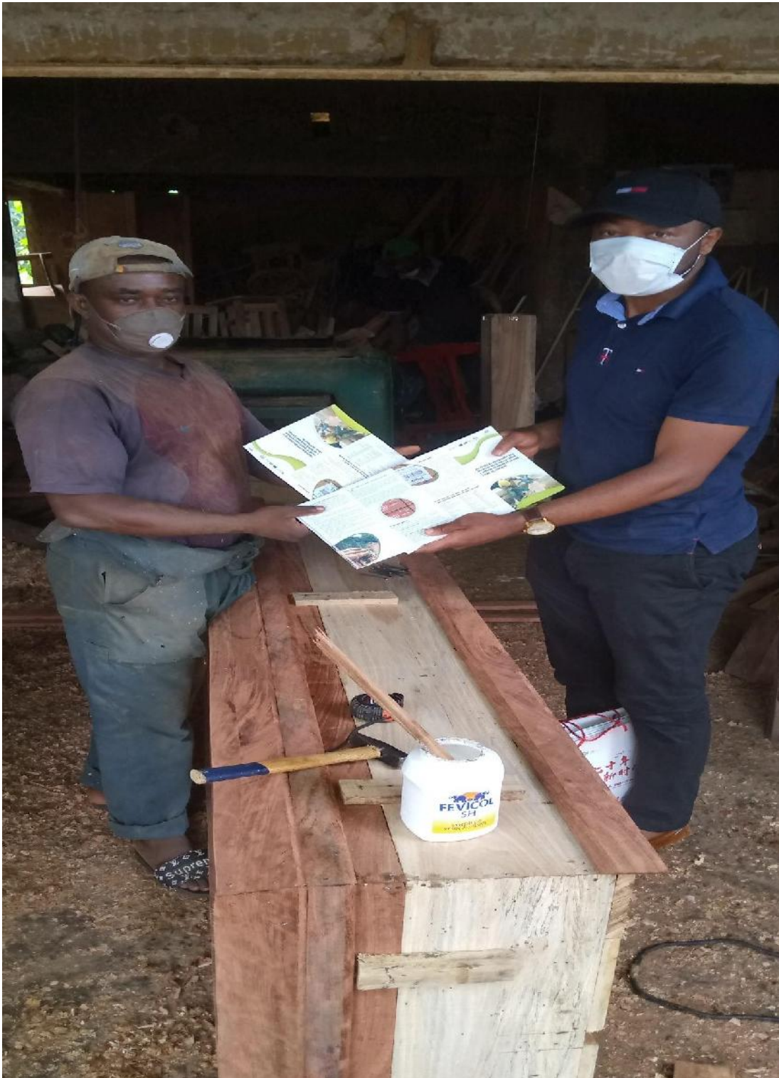
j- Remise des brochures de sensibilisation des PME/PMI et opérateurs artisanaux sur les procédures d'achat du bois légal auprès des entreprises forestières industrielles au Président de l'Association des Menuisiers d'Ebolowa , Sud - Cameroun