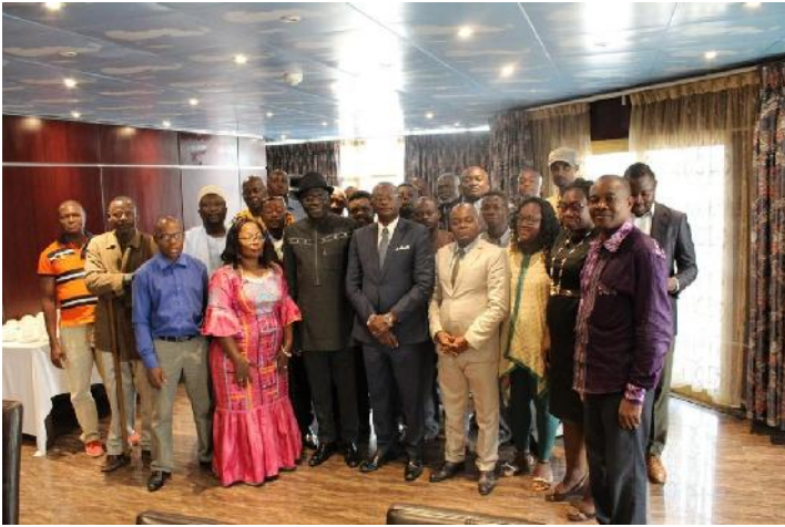
a- Atelier de validation de l'annuaire des PME/PMI et opérateurs artisanaux