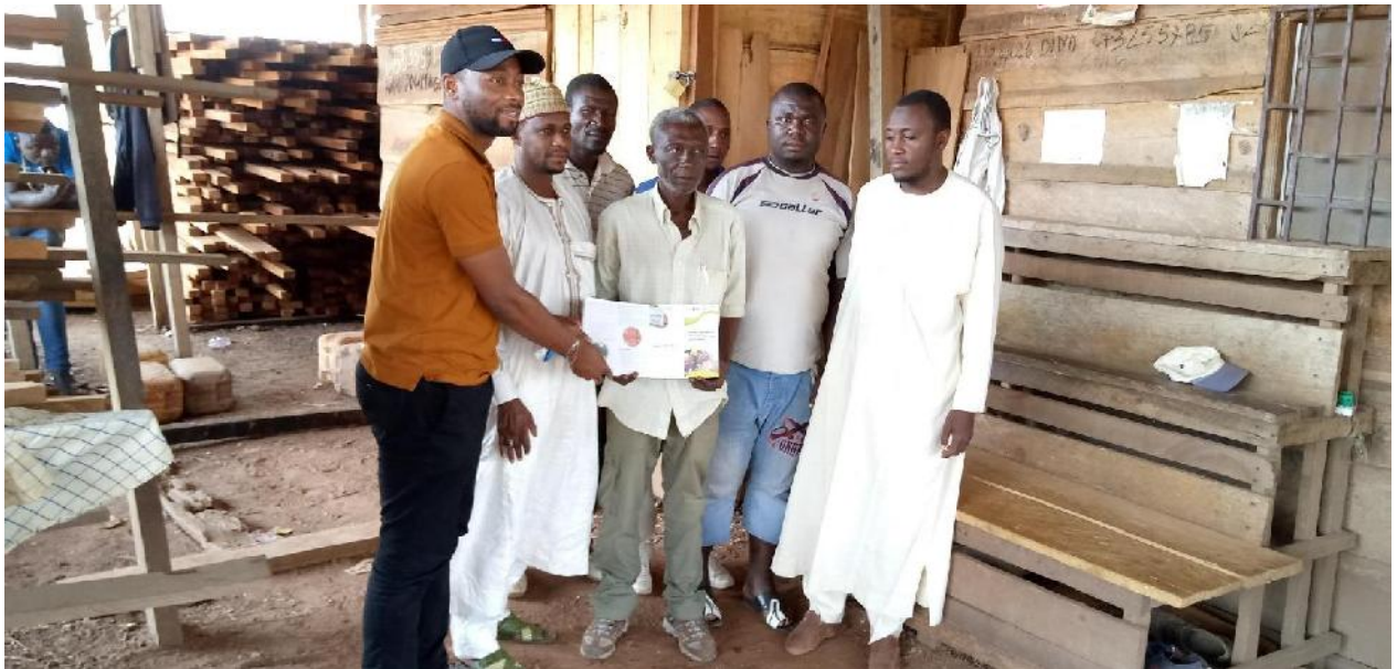
L- Remise des brochures de sensibilisation des PME/PMI et opérateurs artisanaux sur les procédures d'achat du bois légal auprès des entreprises forestières industrielles au Président de l'Association des vendeurs de bois de Bertoua, Est - Cameroun