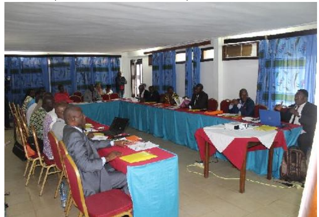
d- Vue de la salle au cours de l'Assemblée Générale Ordinaire de l'IFFB