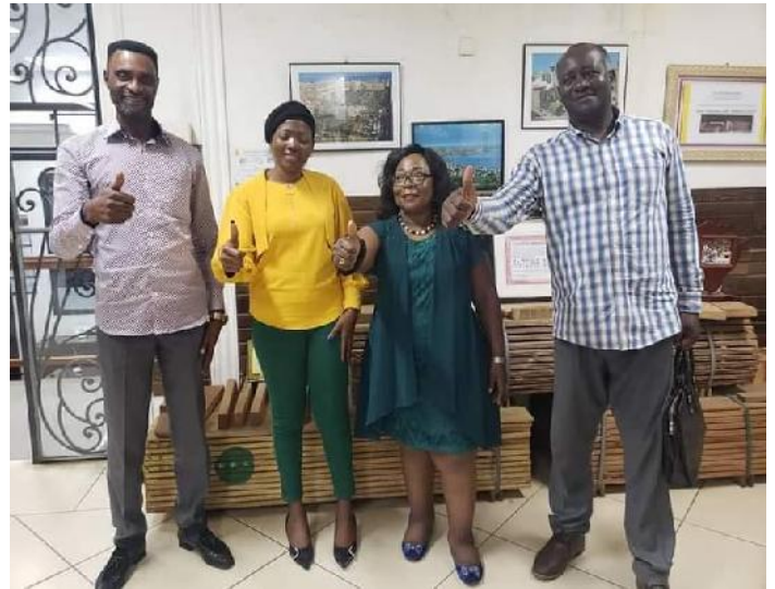
g-Phase de négociation de l'achat du bois légal auprès d'une entreprise forestière industrielle