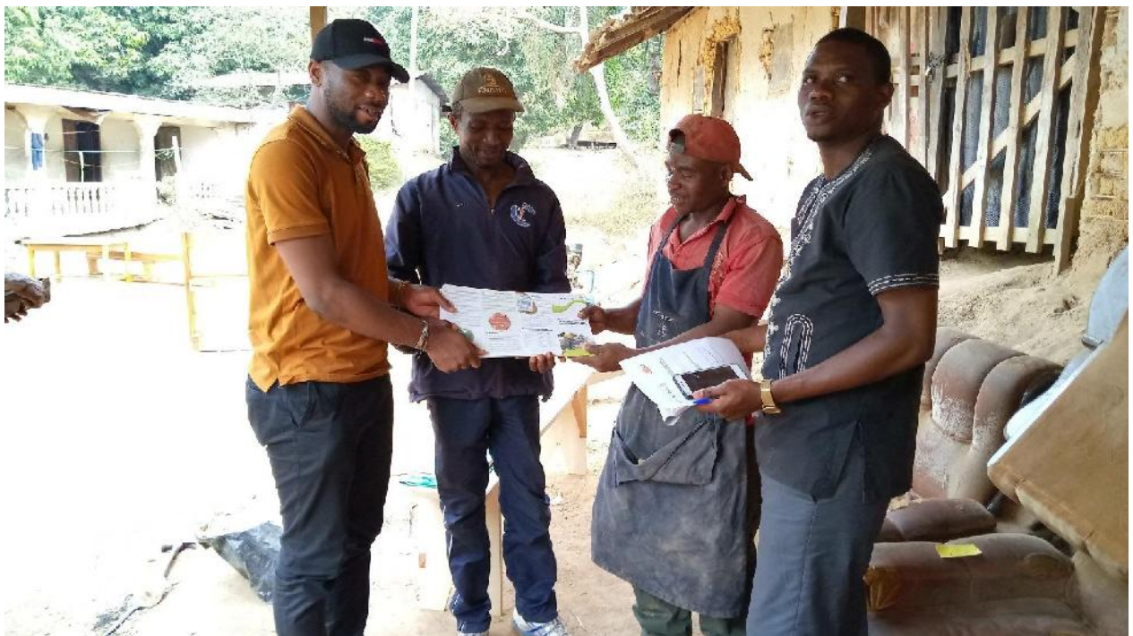
M- Remise des brochures de sensibilisation des PME/PMI et opérateurs artisanaux sur les procédures d'achat du bois légal auprès des entreprises forestières industrielles au Représentant du Président de l'Association ASTRABOIS de Bertoua, Est - Cameroun