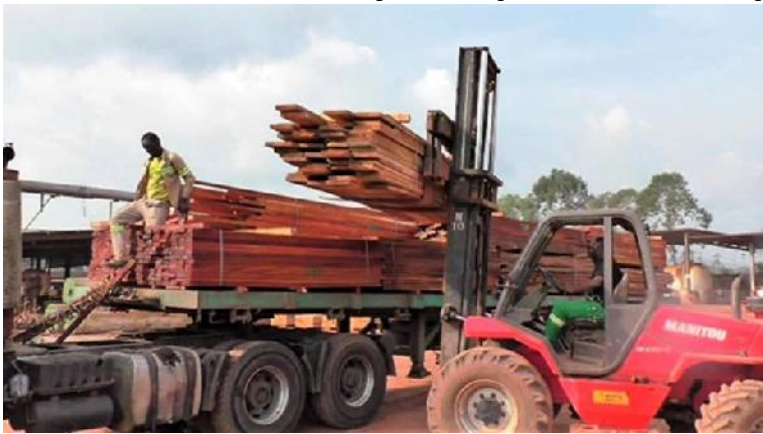
h- Chargement du bois légal acheté par une PME sur le site d'une entreprise forestière