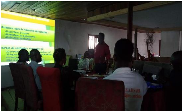
c- Formation des membres de l'association YLA en gestion des cycles de projet