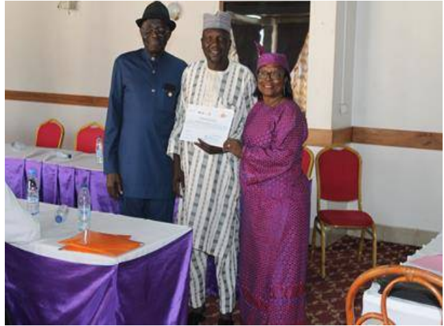
b- Remise des parchemins de formation au représentant de ARTI BOIS