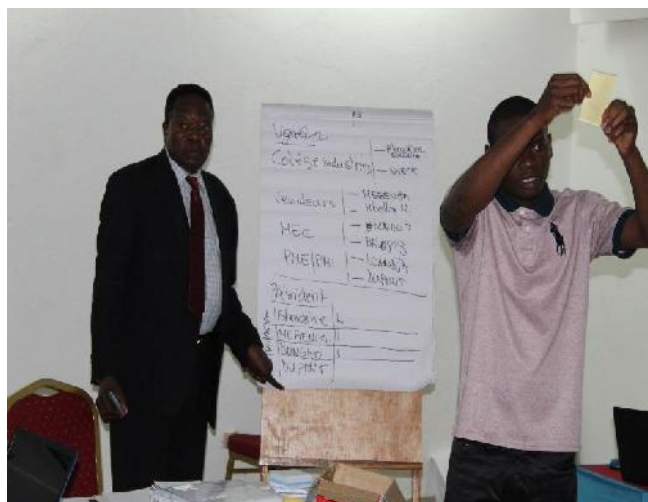
f- Dépouillement des bulletins lors du vote du Bureau Exécutif de l'IFFB