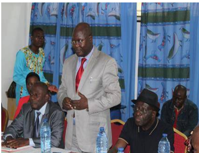
e- Mot du Représentant du MINPMEESA lors des AGO et AGE à Kribi en Août 2019